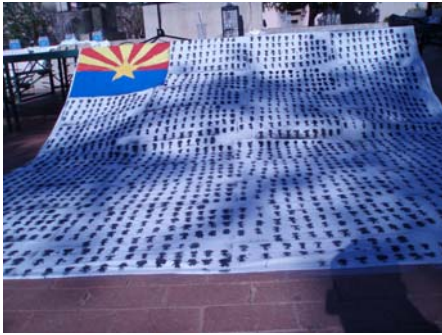
This flag represents the 1,800 rapes that were reported to the police in AZ last year.

This past April, Sexual Assault Awareness Month, the Southern Arizona Center Against Sexual Assault's Rape Prevention and Education Program coordinated a youth-run and youth-organized Take Back the Night in Tucson. Take Back the Night rallies have been organized throughout the United States since 1978 to protest sexual and domestic violence. While Tucson has seen many Take Back the Night events, this was the first in Tucson in which teenagers marched through the streets and publicly spoke out against sexual violence.